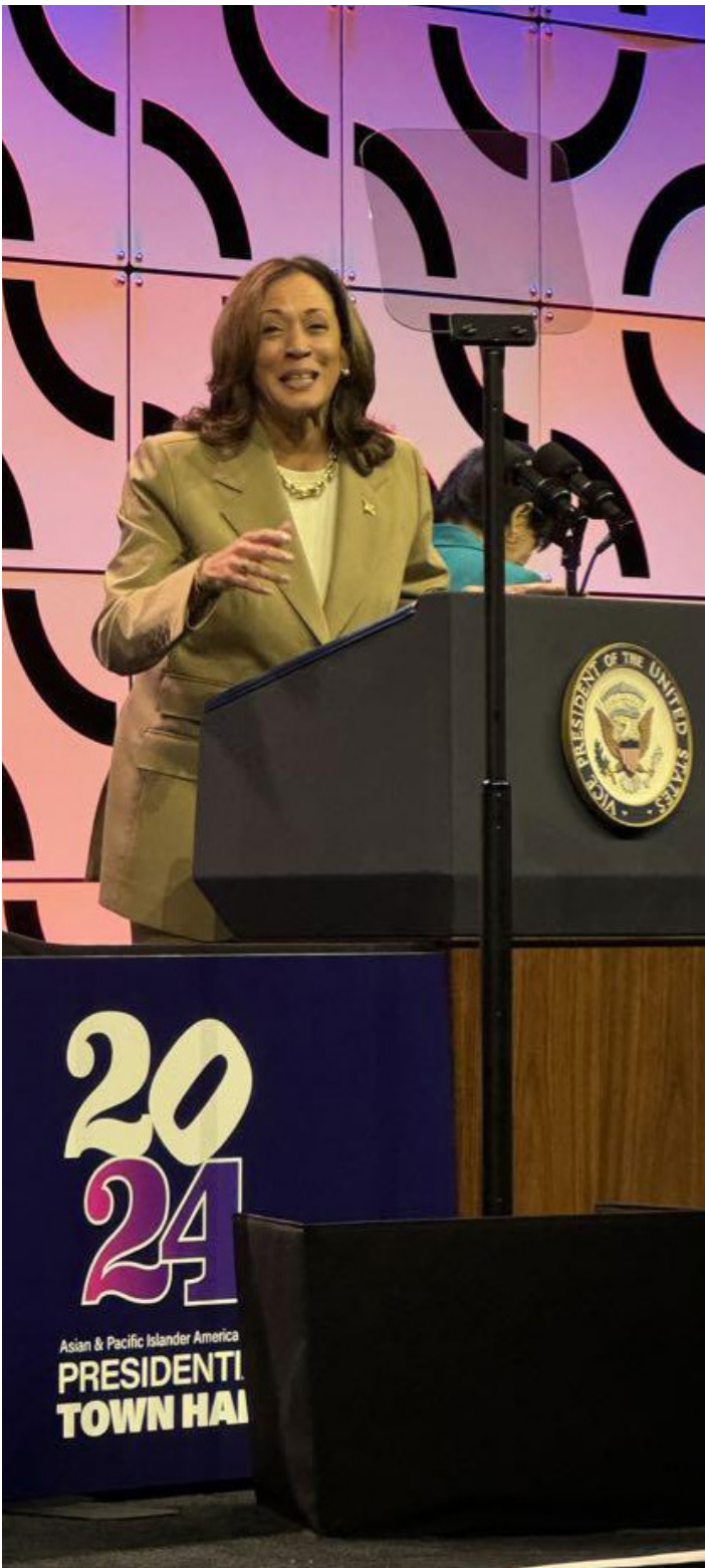
Vice President Kamala Harris spoke at the Presidential Town Hall held at the Philadelphia Convention Center on July 13, 2024.