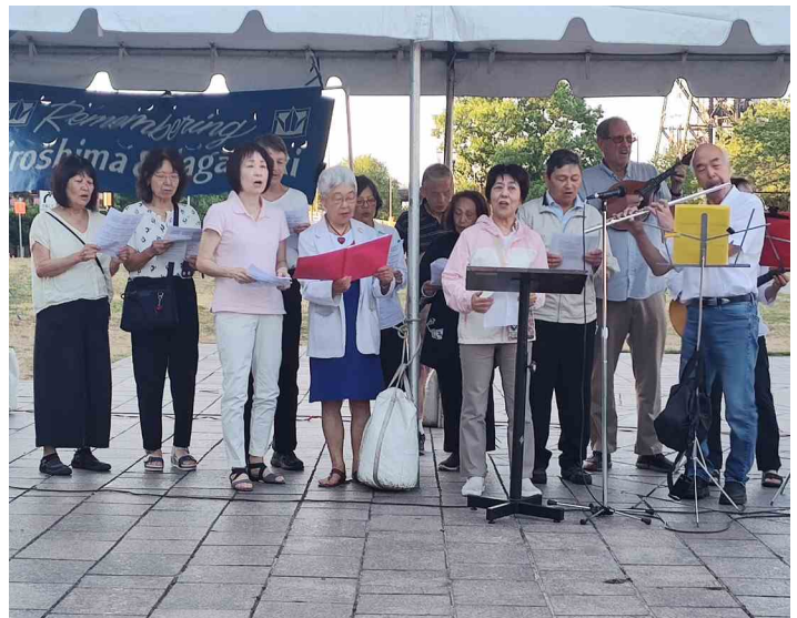
The Hiru Gohan Group from Ikoi No Kai played a song at the annual Hiroshima/Nagasaki Day ceremony on Aug 6, 2024 at the JA Historical Plaza.